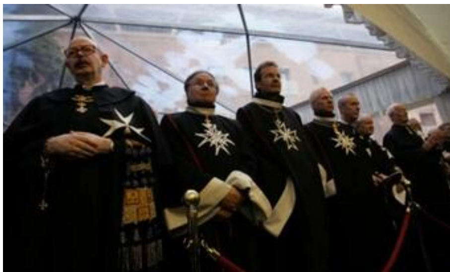
JANUARY 19, 2011, 9:55 PM

Who Are the Knights of Malta – and What Do They Want? ( https://foreignpolicy.com/2011/01/19/who-are-the-knights-of-malta-and-what-do-they-want/ ) They're a secretive religious order with a long and bloody history and unique status under international law, but that doesn't mean they run the world.